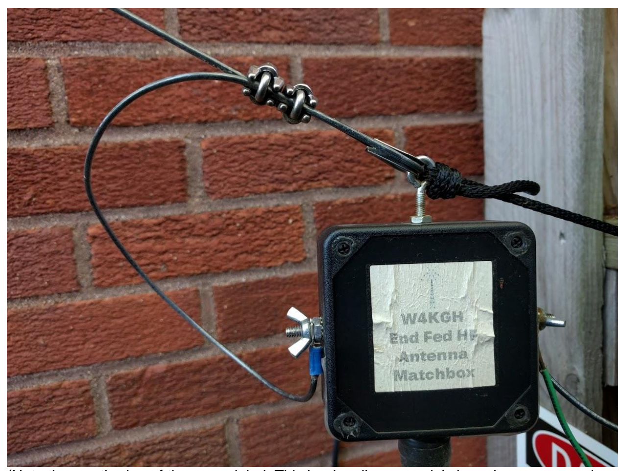
(Note the weathering of the paper label. This is why all new models have laser-engraved labels.)

Here is one ham's (Russ, AD0QH) method of hanging the matchbox that I highly recommend. It puts all the strain on the eye bolt.